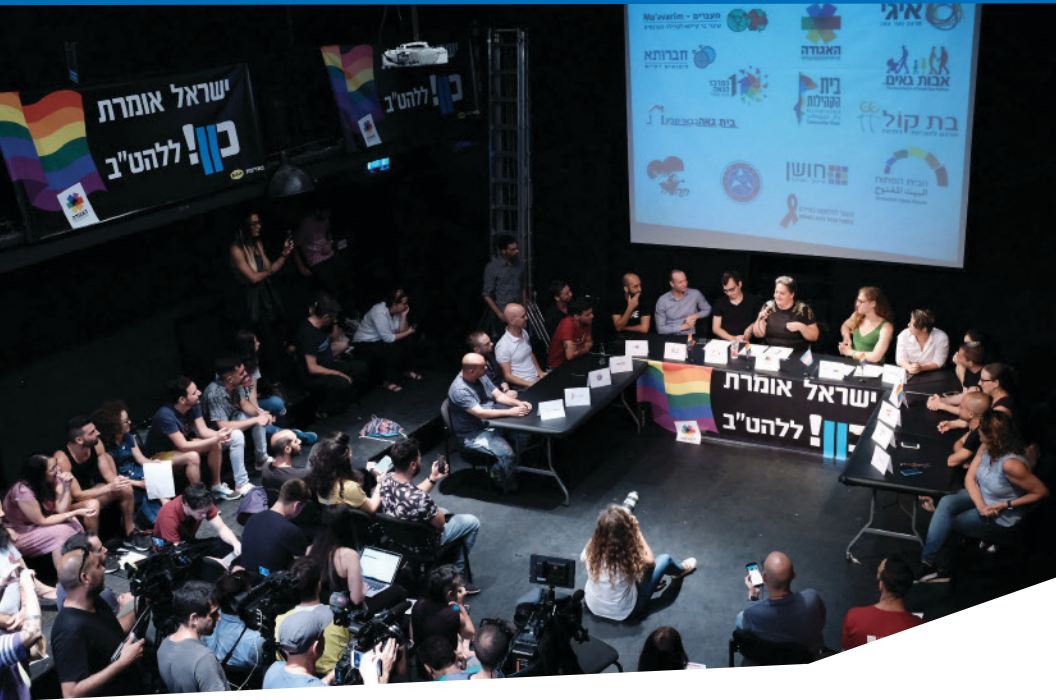
Aguda members hold a press conference in Tel Aviv on July 25, 2018.

There are at least twenty-five different organizations that exist to support LGBTQ+ Israelis.