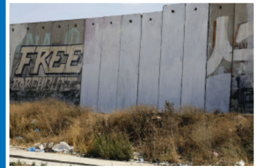
After a Palestinian artist painted a rainbow flag on the West Bank security barrier, homophobic Palestinian activists erased it in outrage.