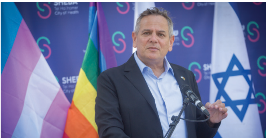
Former Minister of Health Nitzan Horowitz speaks during his visit at Tel HaShomer hospital in Ramat Gan, August 3, 2021.

Nitzan Horowitz was Israel's first gay party leader and Health Minister. He was elected to Israel's Parliament in 2009 after a career in journalism. In 2013, he co-founded an LGBTQ+ caucus, or interest group, within the Parliament to promote LGBTQ+ rights and equality in Israel.