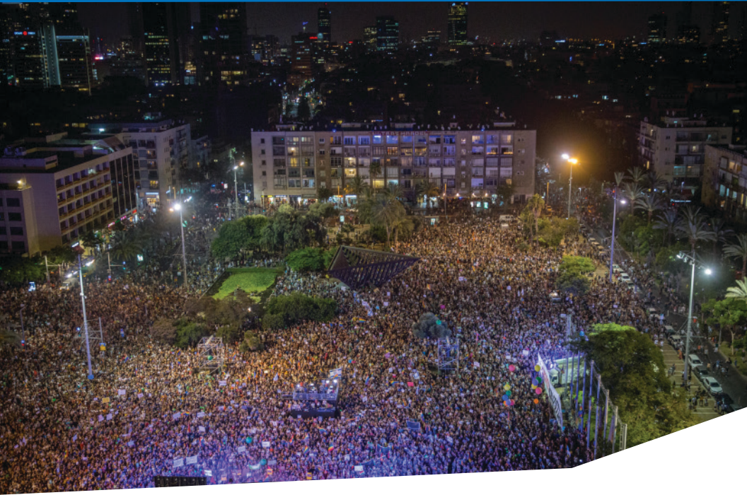
Massive protest for LGBTQ+ rights in Tel Aviv, 2018.

LGBTQ+ Israelis have fought for their rights for decades and achieved remarkable progress. However, they still experience cases of discrimination and intolerance in Israeli society.