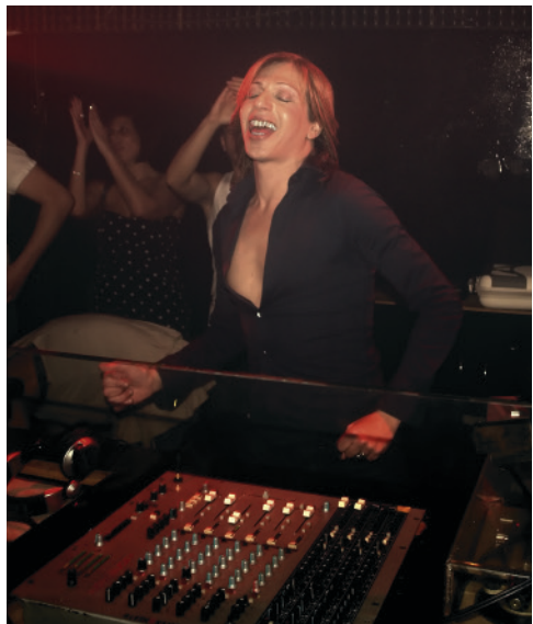
DJ Offer Nissim.

Offer Nissim is among the most famous Israeli DJs in the world. He produced the song "Diva" by Dana International, which won the Eurovision Song Contest in 1998. He has also produced official remixes for artists such as Madonna and Cher.